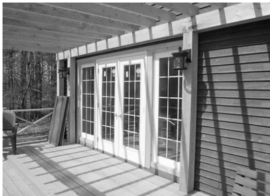
Left: Birches with the new deck and pergola. Top: The view of Owatonna's field from the deck. Above: French doors lead out to the deck from the living room.

functional treatment room, greater storage space, a master bedroom big enough to accommodate a visiting spouse, and more nooks for campers who need a quiet place to take a nap. They changed the entryway as well, incorporating a window and better placed, built-in desk, and opened up the living room with glass doors that provide access to a newly-built deck with pergola that wraps around the building.